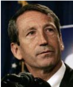
Mark Sanford

From the freewheeling, “going rogue” Sarah Palin; you betcha! — to the “slit our wrists” Congresswoman Michele Bachman, to the poetic love sonnets of Governor Mark Sanford, to the ramblings of Senator John Boehner with his “ I haven’t met anyone for public health care, ” to Texas Governor Perry’s wanton rants about secession and the recent cover up (of the execution of an innocent man), to Congressman Joe Wilson’s embarrassing outburst during the presidential address to congress, and let’s not forget Senator Demint’s support of the Honduran military coup (of the democratically-elected president) and his own comments about how openly-gay people and single mothers should not be allowed to teach in our public schools... makes one wonder how we, as a nation, have come to this point. From where did these elected officials come? Mars?